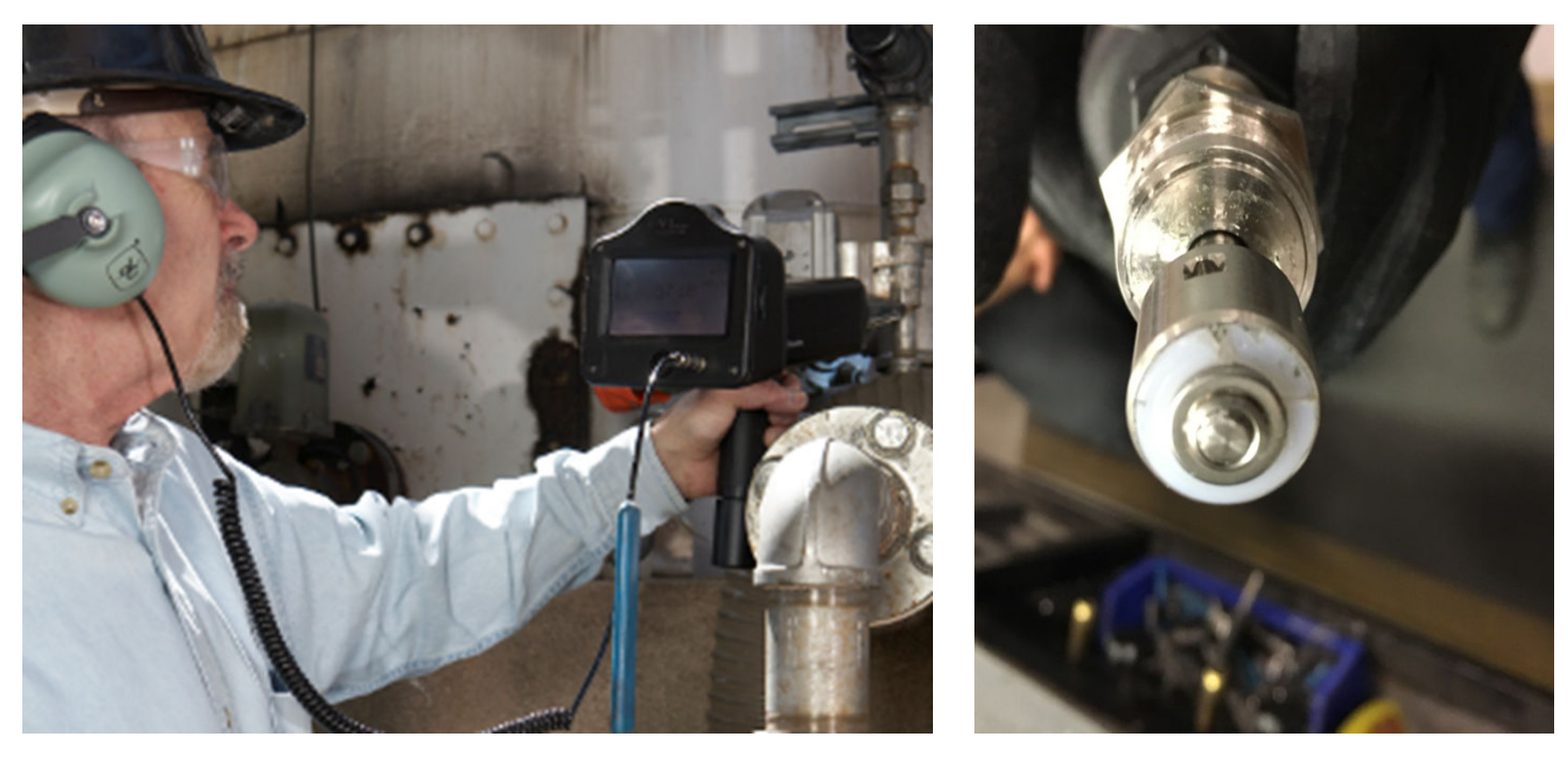
Figure 3 Inspector performing leak detection on critical facility equipment using the UE Systems Ultraprobe.

The important thing to remember is that leaks can occur in nearly any machine in a plant. The main cause of leaks can be linked to a specific occurrence – when fluids move from a high-pressure area to a low-pressure area. When the fluid enters the low-pressure point, turbulent flow is created. Turbulence produces white noise by disturbing the air molecules, which contains low and high frequencies. The Ultraprobe is able to tune in by looking for high-frequency areas. By ignoring the lower frequencies, ultrasound technology can accurately locate and identify a leak, even in a noisy plant environment.