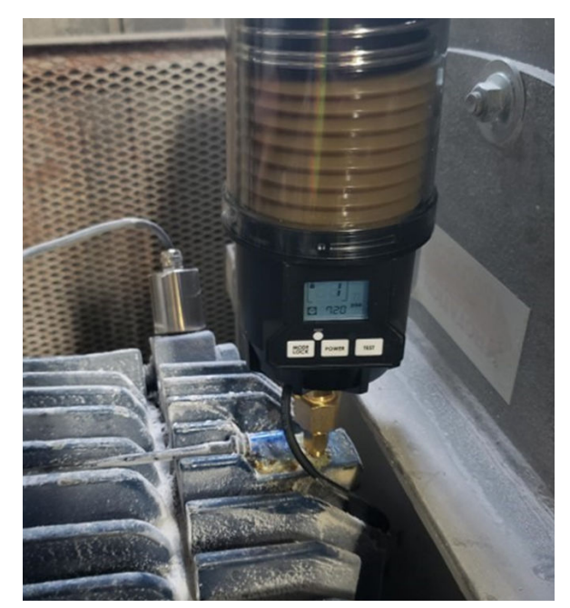
Figure 1 OnTrak system installed monitoring the real-time lubrication needs and health of the bearing on an air handler motor.

While traditional regreasing methods are relatively cheap to implement, it almost always results in over or under lubrication, leading to suboptimal bearing function. Having the OnTrak System in place can play a large role in preventing machine failure by eliminating guesswork—the M-UE Single-Point Lubricator not only applies the lubricant with unmatched precision, but also keeps the lubricant enclosed, preventing contamination often associated with manual application methods.