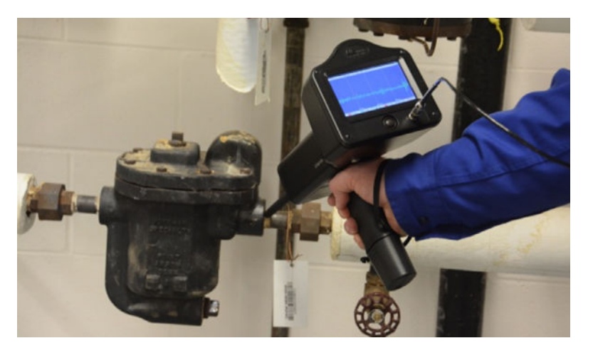
Figure 2 Inspector performing steam trap inspection on plant steam system using the UE Systems Ultraprobe.

If ignored, defective steam traps can pose serious threats to plant profitability, efficiency, and safety. UE Systems' Ultraprobe series helps an inspector identify potential failures in the trap operation in various environments, even in low pressure steam applications like clean steam systems for autoclaves. Inspectors can choose from simple analog instruments to sophisticated digital instruments with onboard non-contact infrared thermometers, sound analysis and data logging features. UE Systems' frequency tuning feature enables users to literally tune into the trap sound and clearly identify leaking or blowing traps.