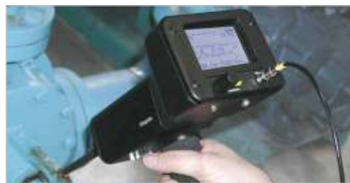
Test/Trend all types of machinery

Ultratone. A unique method that is also employed for heat exchangers is the "Ultratone" method in which a powerful high frequency transmitter floods the shell side of the exchanger with ultrasound. The generated sound will follow the leak path through the tube. A scan of the tube sheet will indicate the leaking tube.