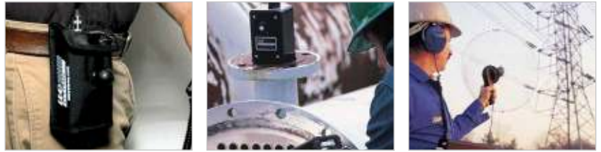
Accessories for enhancing test procedures available