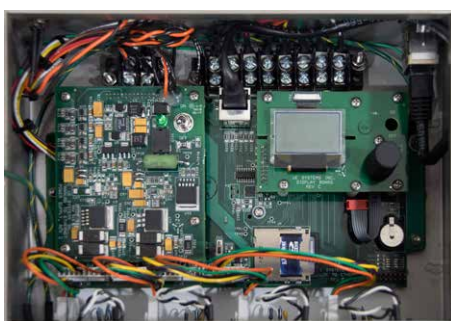
UE 4Cast opened box circuits