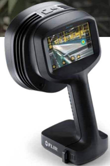
Si2-Pro Acoustic Camera

The key to overcoming these challenges lies in adopting advanced fault detection technology, such as acoustic imaging, that allows for early-stage identification of critical issues. As a recent inspection performed at a metalworking facility indicates,