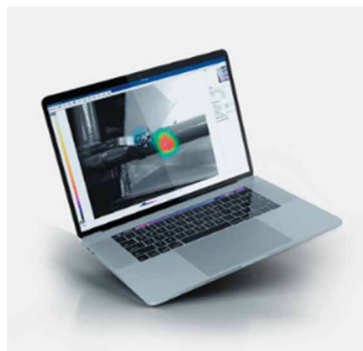
Machine learning-powered analytics provide data-driven decision support on the Si2 Acoustic Camera and FLIR Thermal Studio.

and addressing mechanical faults by embracing advanced fault detection technology, organizations can not only save costs but also enhance the reliability and safety of their operations.