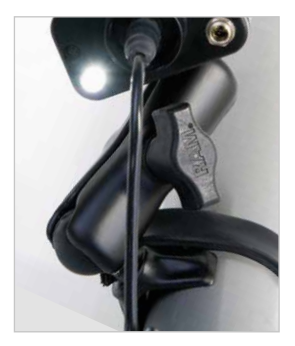
Mounting kit included

As lubrication levels fall, friction levels rise, producing ultrasonic waves, which are very directional and localized. Easily attached to most standard grease guns, or worn in an optional belt holster, the Ultraprobe® 201 Grease Caddy translates high frequency sounds into the audible range, where users will hear and recognize bearing sounds. The Ultraprobe® 201 Grease Caddy focuses in on these sounds – even in the noisiest environment – and helps users identify when to stop lubricating.