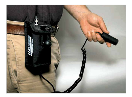
Holster for UP 201