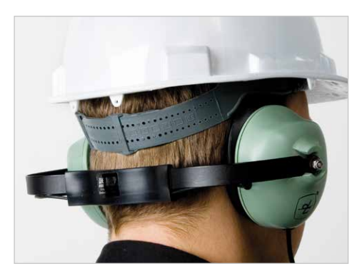
Headset for hardhat use