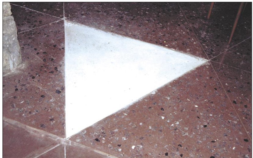
Fig. 4. Accurate location limited damage to a single module.