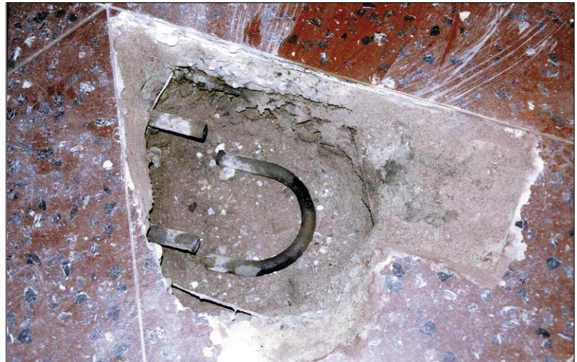
Fig. 3. The bend that leaked (external corrosion).

Ultrasonic detection is probably the most effective and practical method for locating hidden leaks, but it should not be considered a “magic wand”. The instruments are now in the hands of a number of franchised practitioners. Nevertheless, diagnostic “art” and patience will almost always be key to success.